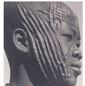
Figure 4 scarification marks on the face