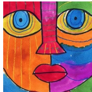
Figure 1 examples of abstract art-modern and ancient

Abstract: something that is not physical, an idea; abstract art portrays what an artist feels and thinks, rather than what he or she sees. An abstract artist uses colors and shapes to express his or her emotions and ideas (see examples in FIGURE 1)