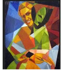
Figure 3 a modern geometric design