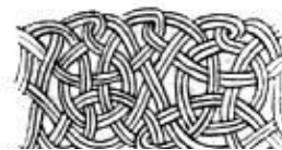
Figure 5 interlacing design

Interlacing: cross or be crossed together, interweaving (see FIGURE 5)